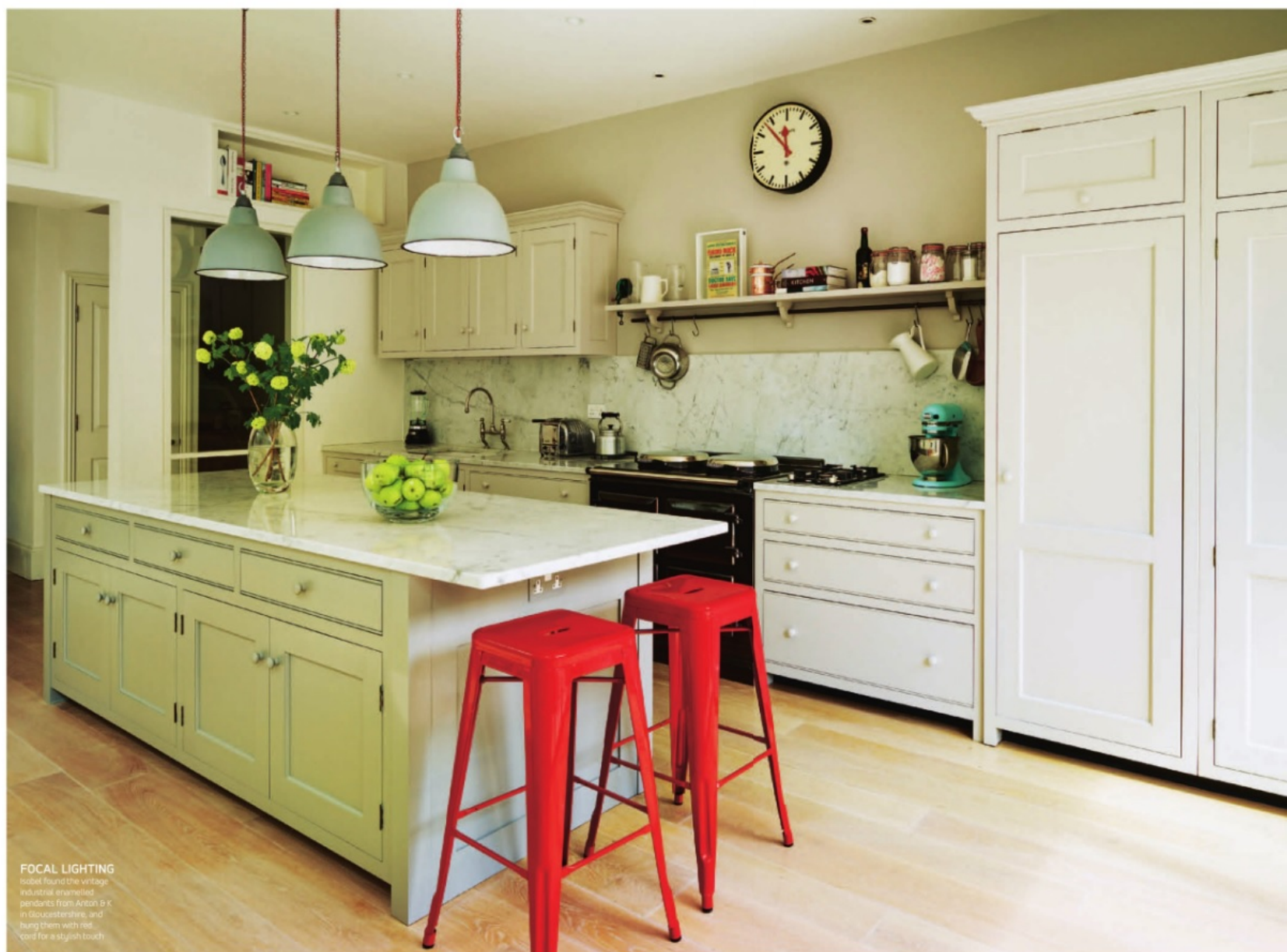
FOCAL LIGHTING Isobel found the vintage industrial enamelled pendants from Artisan & Co in Gloucestershire, and hung them with red cord for a stylish touch.