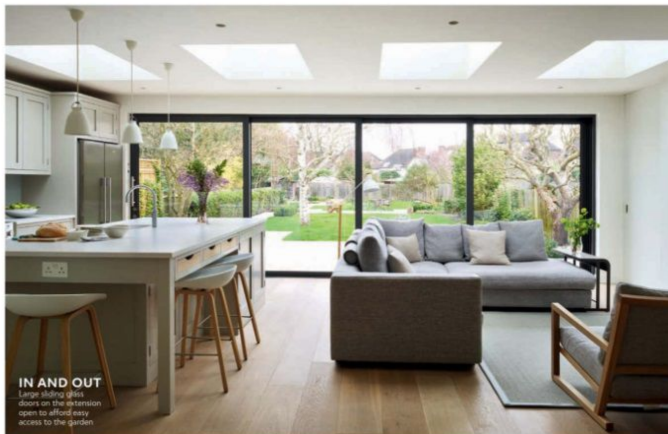
IN AND OUT Large sliding glass doors on the extension open to afford easy access to the garden

« Work is so busy that we wanted to create a place of calm where we can relax and unwind. The result is a very tranquil kitchen space »